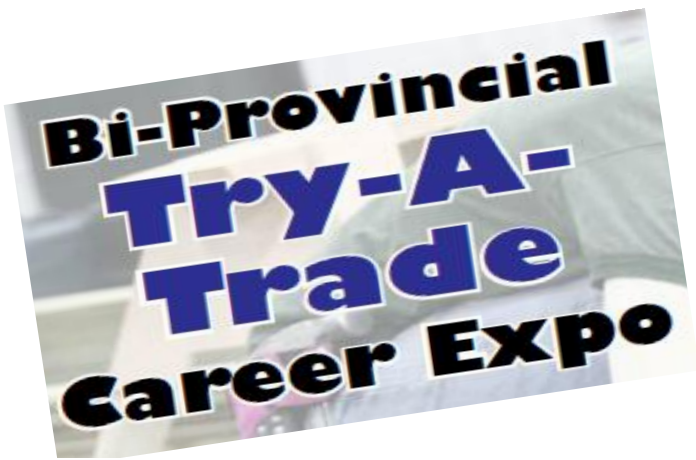
EXHIBIT RATES AND OPTIONS